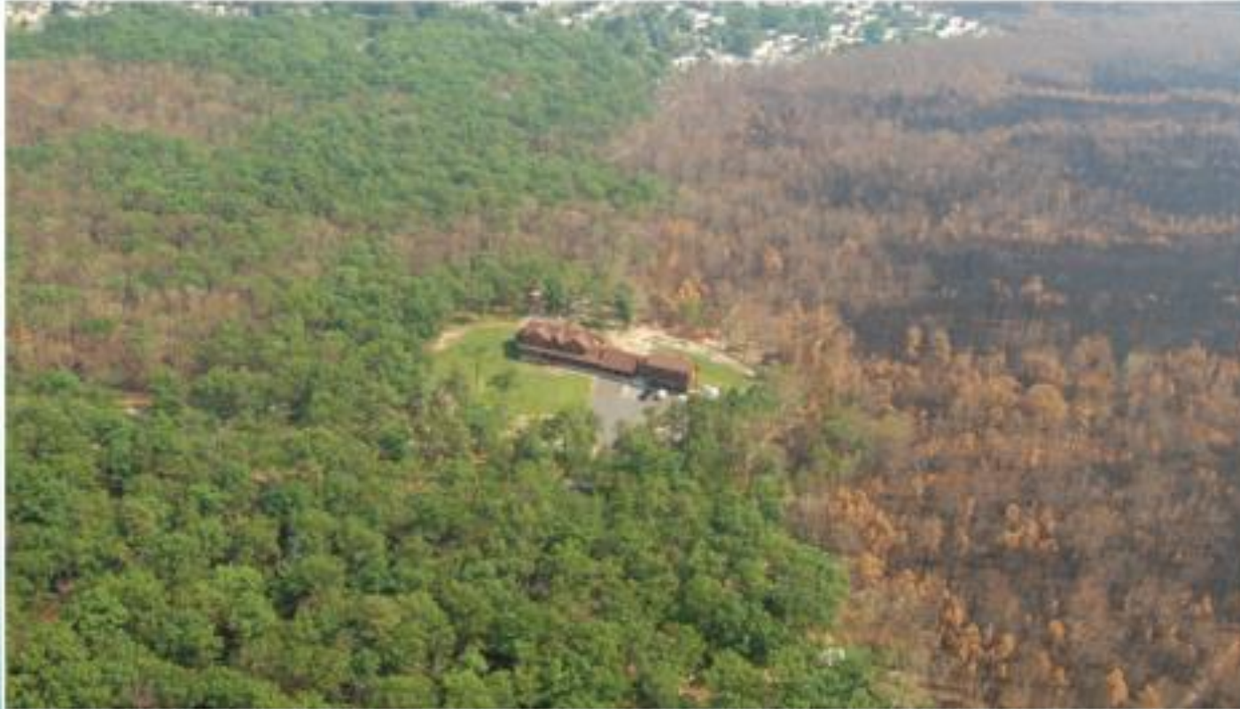
This Pinelands home also survived a wildfire. It has what it takes: 100' of defensible space.